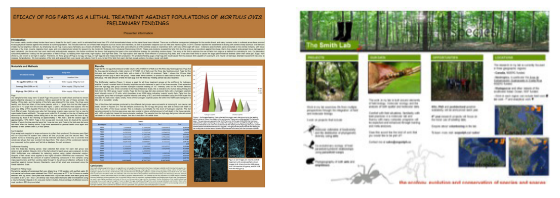
Figure 2. Scientific posters can present more information than other kinds of abstracts, but they are visual, so their effectiveness depends largely on good graphic design. Left panel: A poorly designed poster with too much text, long lines of type, justified paragraph margins, small type sizes, few illustrations, and little white space. Right panel: A well designed poster that is visually pleasing, presents only the main points of the research, and devotes more space to illustrations than to text. (Via Creative Commons CC BY-ND 2.0.).